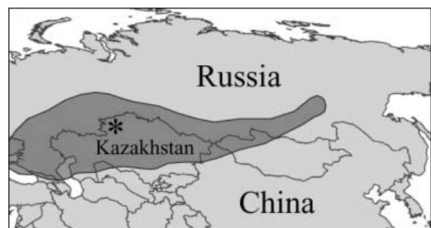
Fig. 1 The breeding range of Eastern imperial eagles in Central Asia. The location ( 51^{\circ}\text{N} , 64^{\circ}\text{E} ) of the Naurzum Zapovednik in north-central Kazakhstan is indicated by an asterisk.

EIE samples were collected at the Naurzum Zapovednik in the Kostanay Oblast of north-central Kazakhstan (Fig. 1) over a 6-year period (1998–2003). Roughly 1200 naturally molted adult feathers were noninvasively collected from nesting sites and developing blood feathers were directly plucked from 227 chicks. These samples represent > 90% of all nesting territories occupied in the zapovednik during each year of collection. Adult feathers were stored dry at room temperature, while developing chick feathers were placed in a lysis buffer (100 mM Tris-HCl pH 8.0, 100 mM EDTA, 10 mM NaCl, 2% SDS) immediately upon collection. Chick samples were stored at room temperature for several months before being ultimately stored at -80^{\circ}\text{C} . The genetic